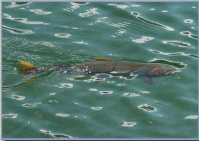
Nice Cut on a cone bead stonefly at Trout Lake Mid Sept. -Dan Mazel