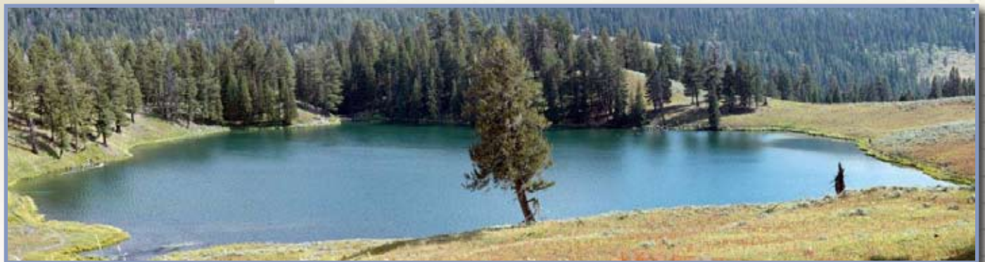
Trout Lake