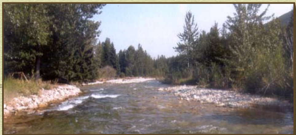
Rock creek on the day of the clean-up that was sponsored by the MCFF