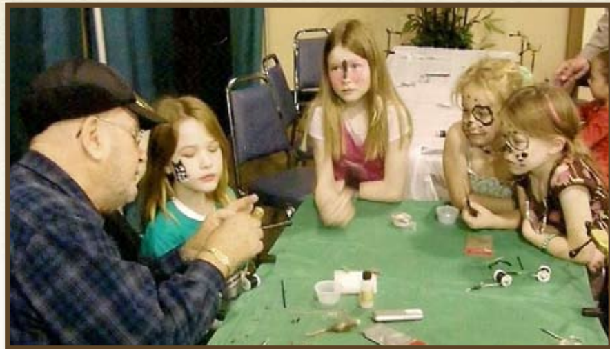
The Hackle Bender is a monthly publication of the Magic City Fly Fishers, Chapter 582 of Trout Unlimited, and an affiliate of the Federation of Fly Fishers. It is published by and for the members of the Chapter.

That night is our Expo Banquet and is the only fund raising event our club has for the year. Everyone has been very generous and gracious in the previous 6 Expos. This year we will once again have an auction featuring custom-framed artwork, fly rods, reels, equipment, guided fishing trips, and custom-tied flies by distinguished area fly tyers. In addition to the auction we will have bucket raffles and give away boards. The big ticket item this year will be a drawing of a beautiful drift boat. We will be selling only 100 tickets at $100 each. Remember, the funds raised from this Expo enables our board of directors to support some the programs that have made the club what it is today.